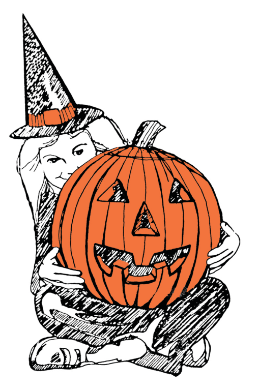
by Willie George

Print on letter size landscape. Trim 1 7/8" off bottom.